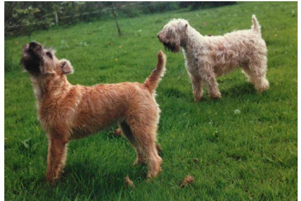
Macfinn Magic Maker as a pup and Holmenocks Hoffberg