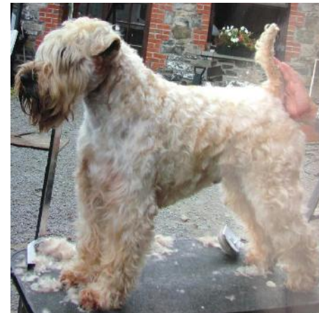
Macfinn Macken Age 11 years

The other is Macfinn Macken known as Macken, who has never become a champion himself but who has sired many champions not only here in Ireland but abroad as well, in countries such as Finland, Sweden (also a Danish Champion) and Russia. Macken lives in harmony with his son, grandson and great, great grandson.