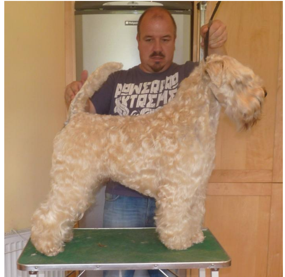
CH & GB CH Feanaro Niallan Naomhan

excellent type, construction and movement, crowned by a beautiful coat of correct texture, she was owned by Tempe Pearson.