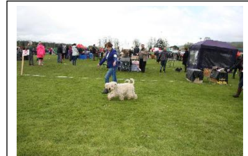
Best Brace - CH Dalstar Giselle Jun Ch, CW-11 & Kealdale Nutmeg Jun Ch