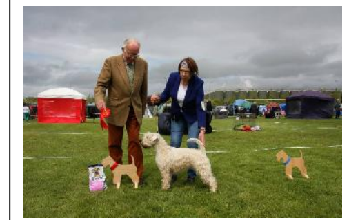
Int Bitch - Kealdale Nutmeg Jun Ch