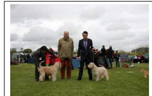
Junior Dog - Macfinn Magneto(R) & Macfinn Victor Creed (L)