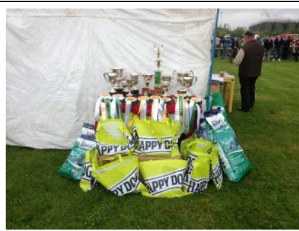
Cups and Rosettes with the food kindly sponsored by Happy Dog