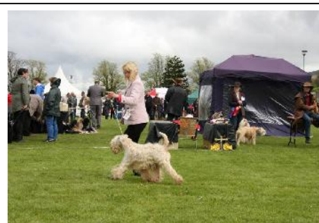
BGS CH Hobel I Love You Jun Ch, InTerra Winner 11, CW-14