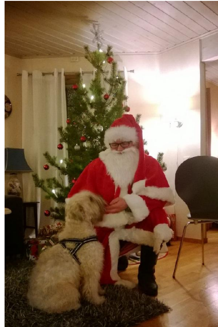
Santa Claus and his little helper, Arktikko's Fenella

MERRY Christmas and a Happy New Year From All Of The Committee and Officers Nollaig Shona agus Athbhliain faoi Mhaise Duif