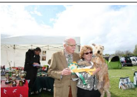
Best Baby Puppy - Hobel As Time Goes By