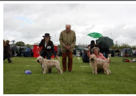
Open Dog - Hobel A Matter Of Moments CJW-14 (L) & Parkalissene Faolan