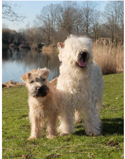
Strongbow's Nóe Mi na Samhna & Strongbow's Loinnir Juverna

If you look at the standard, the breed has deteriorated. The Wheaten of the Irish type has a very difficult time. For many breeders, success in exhibitions is more important than maintaining the original Wheaten type. Irish Wheatens are on shows in the shadow of the American type, as many international judges prefer the American type. Due to the change on shows, breeders of the Irish type became more and more rare. Many switched from Irish to Mixed/American type.