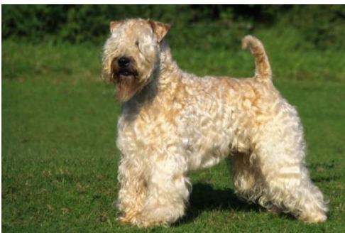
CH Strongbow's Grastuil Flannery

I've had great success with "Strongbow's Conway Fintain" (Fenian O'Connor & Yesterday's Hero Cherley Sheleen). He was honored with many champion titles and showed himself successfully at an old age at many exhibitions.