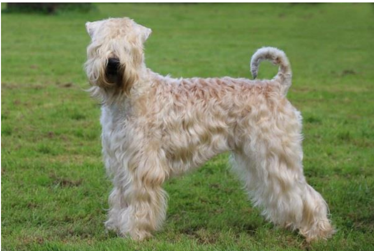
CH Strongbow's Laoise Meabh

My youngest offspring female is "Strongbow's Laoise Meabh" (Honeyrags Smokey Duncan & Strongbow's Méan Fomhair). In addition to my own dogs, offspring from and with Strongbow's have been successfully exhibited.