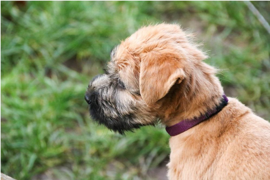
Typical Irish Puppy