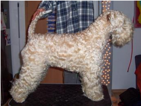
CH Strongbow's Conway Fintain

Since 1997 I have bred 14 litters. Of course, there is no such thing as THE perfect dog. The quality of the dogs is predominantly measured with success at exhibitions. But the results at exhibitions are not the most important thing for my breeding. First and foremost, I breed family dogs whereby I consider health as the absolute priority.