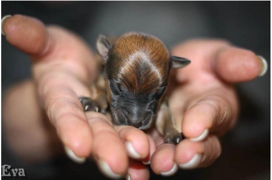
Puppy out of my L-litter

3. Apart from the Wheaten you were dealing with, which 2 or 3 Wheaten would you describe as the best you saw and why?