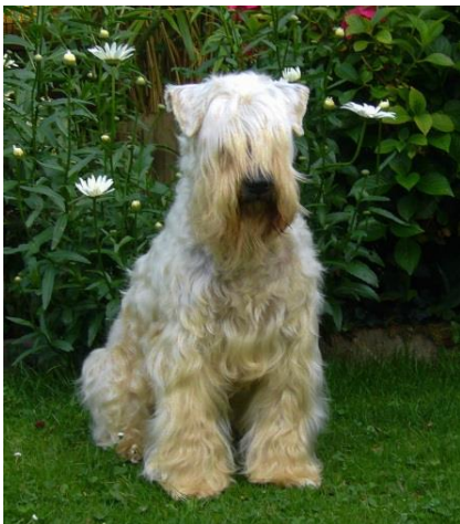
Strongbow's Bright Blizzard