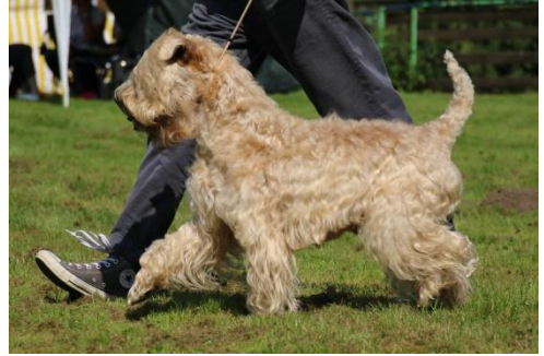
Honeyrags Smokey Duncan