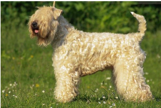
CH Strongbow's Eimhin Narbhflaith

I have celebrated huge successes with "Strongbow's Eimhin Narbhflaith" (Choroschie Drusja's Amazing Boy & Strongbow's Finola Keeva). This level of success remained stable even at an old age: at the age of 13 ½ years she finished her show career with the title Veteranen-Europasieger.