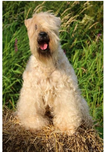
CH Strongbow's Eimhin Narbhflaith

Breeders of these wonderful dogs shouldn't breed only for the success in the show ring and the sale of the puppies. They should rather remember the originality of this breed. Breeders of the pure Irish lines should pass on the puppies of their litters with the utmost care to breeders, whom one can trust and which commit themselves to mate these offspring and their descendants only with purely Irish lines. In my opinion, siblings should not be sold to different breeders: Quality not quantity.