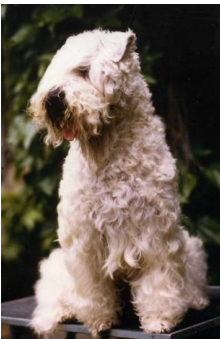
Ch Newkilber The Quiet Man