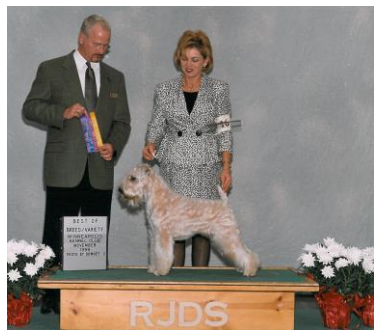
Am Ch Geragold Lady Lavery.