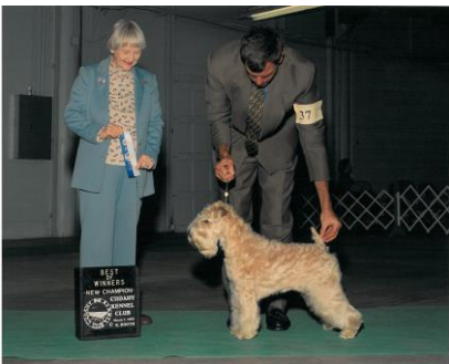
Am Ch Geragold Lady Lavery

Am Ch Geragold Lady Lavery. (She was the mother to a great producer Am Can Ir Ch Geragold Orla Finlandia).