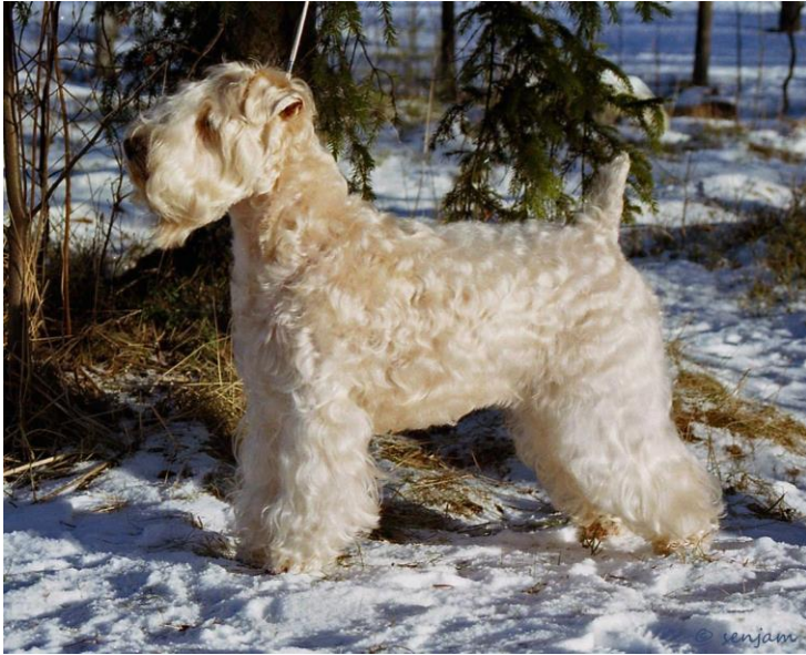
Ch Holmenock Honey Bee

Ch Holmenocks Honey Bee, she was the right size, the correct shape, moved well and had a gorgeous flowing wavy warm wheat coloured coat. Ch Newkilber The Quiet Man, he was a stallion of dog, owned the ground he stood over, with the most superb movement.